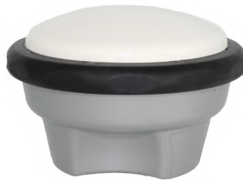
Part Number: 44830-10