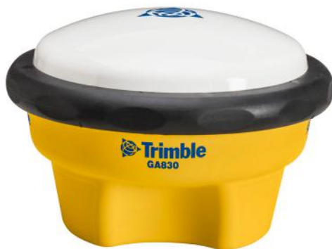
Part Number: 44830-00-INT